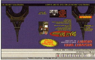
The home page of Wild Women, a tour company in Sebastopol, Calif.